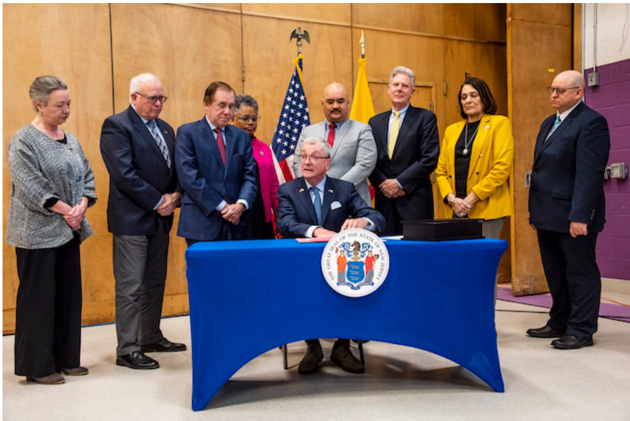
Murphy signs A5684/S4055, expanding access to free school meals for N.J. students